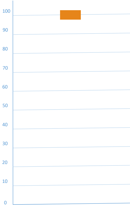
Alternative 1 Pure Helium